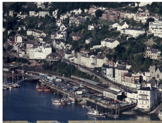
Left: Kingswear before the Hall • Right: Kingswear with the Hall established